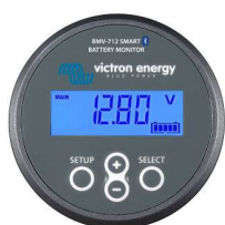
Bluetooth sensing BMV-712 Smart Battery Monitor