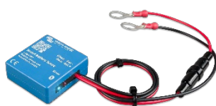
Bluetooth sensing Smart Battery Sense