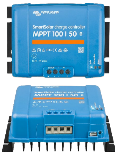
SmartSolar Charge Controller MPPT 100/50