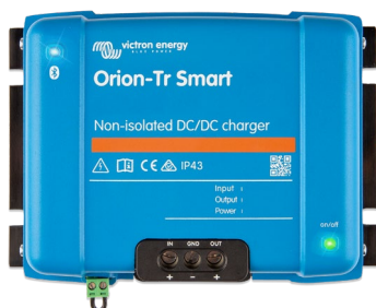
Orion-Tr Smart non-isolated 12/12-30