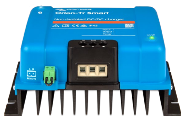
Orion-Tr Smart non-isolated 12/12-30